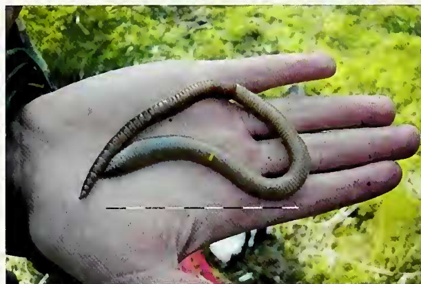
Fig. 3. Large dew worm from Papadil with yellow Visual Implant Elastomer (VIE) tag immediately prior to release; scale bar of 10 cm.

Tagging/Fencing Treatment (TF) Midden-related dew worms were treated as in (T) but then the square metre plot was isolated with fencing (as described above). This was to restrict movement away from the treatment square, if home burrows were compromised by the vermifuge extraction process.